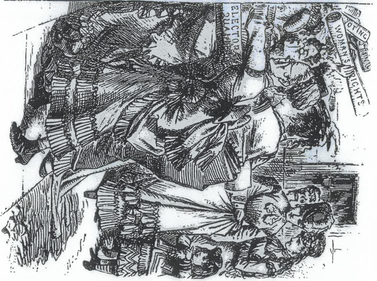
AN "UGLY RUSH!"